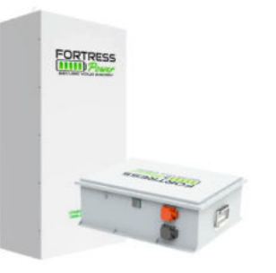
LFP-5 & LFP-10 BATTERY SERIES