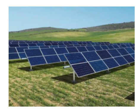
1-AXIS MULTI ROW HORIZONTAL TRACKER HYPERION-MR®