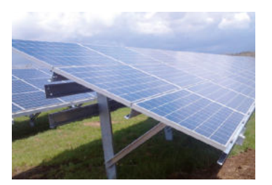
3 MODULES LANDSCAPE