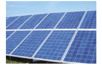
2 MODULES PORTRAIT