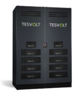
TESVOLT TS HV 70 STORAGE SYSTEM