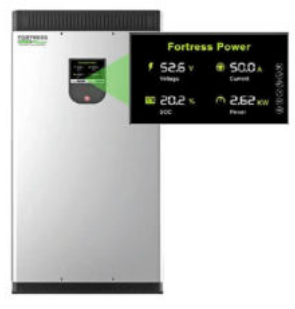
EVAULT 18.5KWH LFP BATTERY