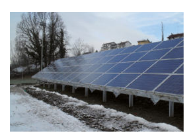
4 MODULES LANDSCAPE